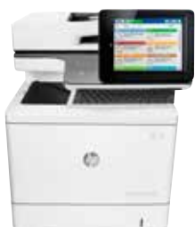
HP Color LaserJet Enterprise Flow MFP M577z