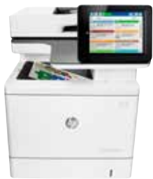
HP Color LaserJet Enterprise MFP M577dn

Ideal for enterprises and medium businesses that need a secure, highly productive, energy-efficient colour MFP.