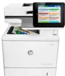
HP Color LaserJet Enterprise MFP M577f